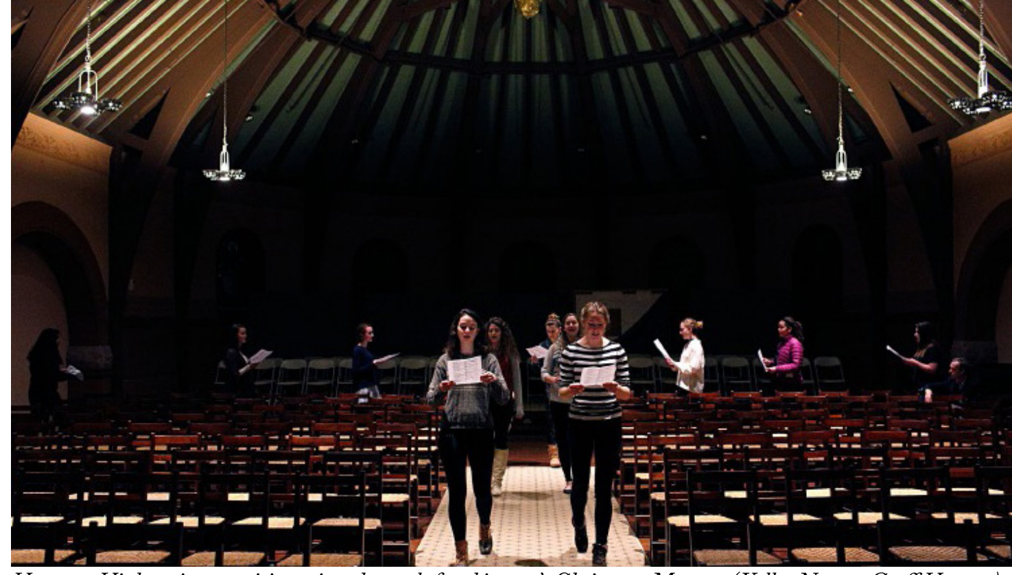
Hanover High seniors participate in rehearsals for this year's Christmas Mystery