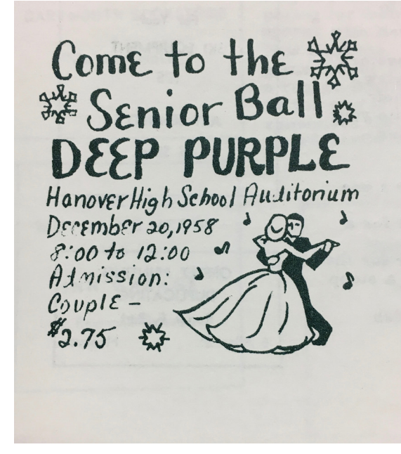
The Hanover Harpoon advertises for 1958's Senior Ball (see below)