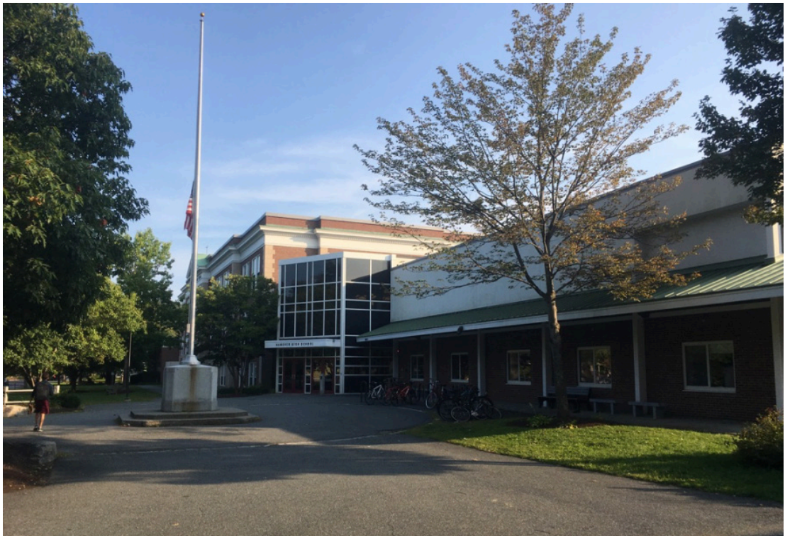
Hanover High School on a late summer evening.