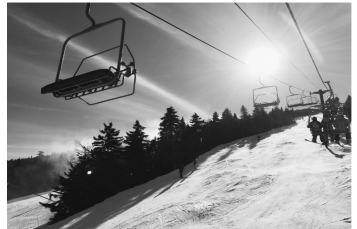
The Slopes