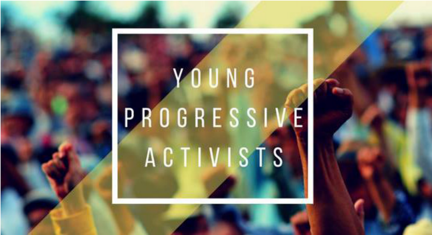
The Young Progressive Activists Club advocates for nationwide social issues